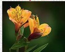
Day Lily 14 Advanced - Close-up First Place Jerry Reece