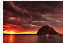
The Admiral Intermediate - Places First Place Dave Ficke