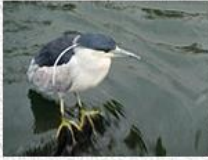
Fishing Apprentice - Animal First Place Lois Ritchie-Ritter