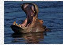
1 800 Dentist Intermediate - Animal First Place Mary Ann Ponder