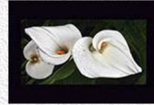
Lily Intermediate - Close-Up Second Place Sue Thalasinis