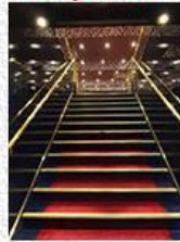
Stairway To The Stars Intermediate - Open/Misc Second Place Bitsy Bernor