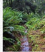
Welcome To The Jungle Intermediate - Places Third Place Erik Berliner