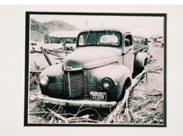
End Of The Road Renee Carroll-Sampson