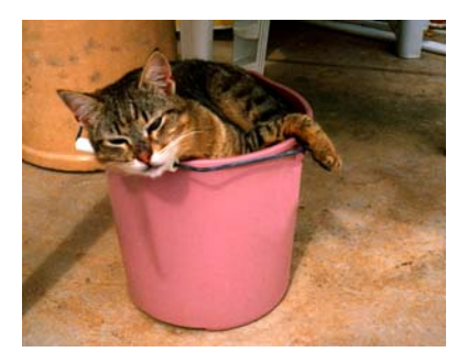
Spooky in Bucket Jim Aslanis