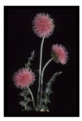
3 Thistle-A Lois Behrens