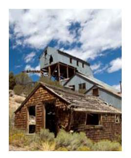
Belmont Mine Bessie Reece