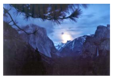
Moonrise At Inspiration Point