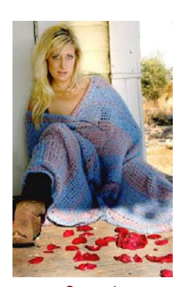
Strategic Cami Cloe Oetman