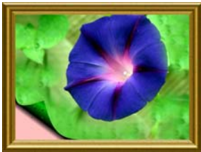
Morning Glory Gabi Rea