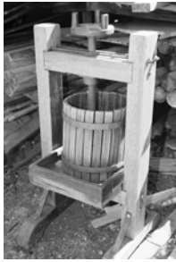
Cider Press Dale Showman

300 ppi JPEG, no larger than 5"x 5" (will probably be reduced for publication). Editor will make every effort to display as many members' images as possible. See Photogram Submissions box for deadline and submission information.