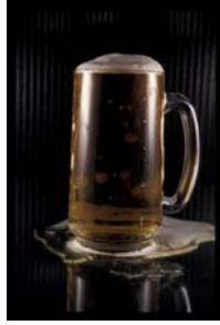
Glass of Beer Lois Behrens