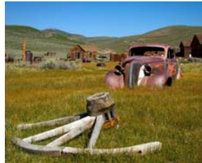
Bodie - End Of The Trail Jerry Reece