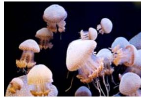
Jelly Bellies Bessie Reece