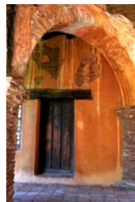
Capistrano Mission