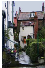
Fishing Village Robin Grube