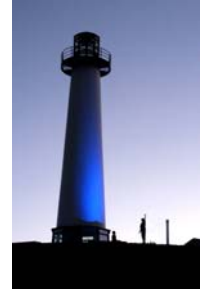
Lighthouse Kish Doyle