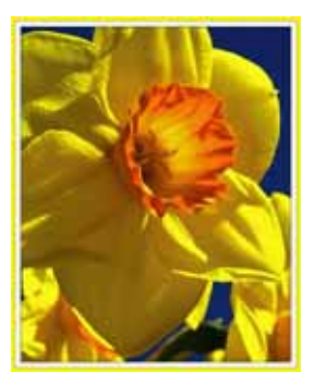
Good Morning Sunshine Jerry Reece