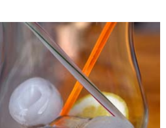
DSC 1441 Dennis Plourd