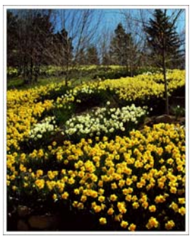
Gold 'n Cream Bessie Reece