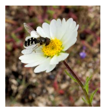
Flower and Bee Patrick Flood