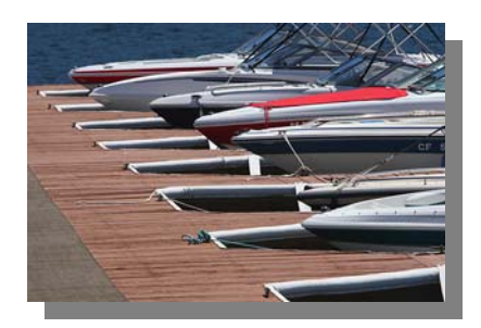
Boats Tyler Nordgren