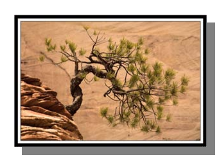
Twisted Tree Jerry Reece