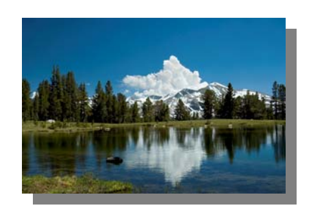
Near Tioga Pass Bessie Reece