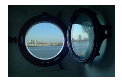
Porthole Reflection Fred Nicoloff