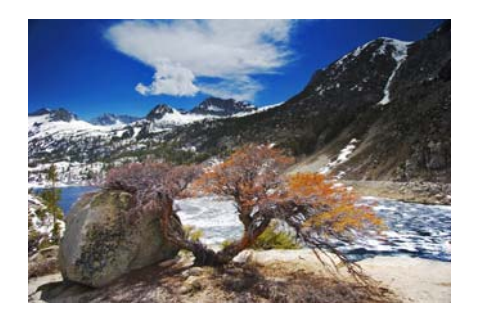
South Bishop Lake Patrick Flood