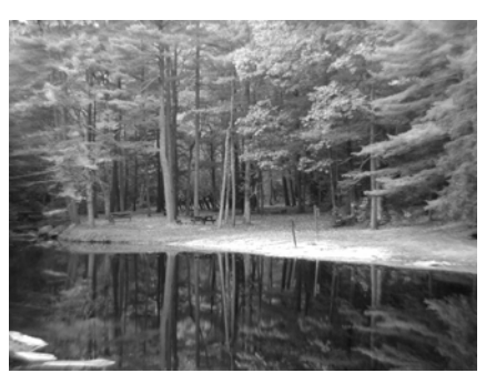
Quiet Place Dale Showman