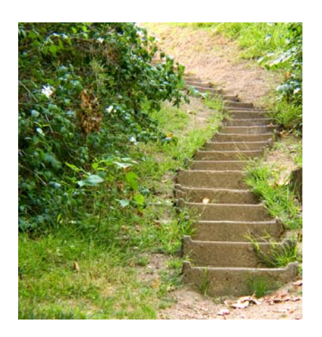
Pathway