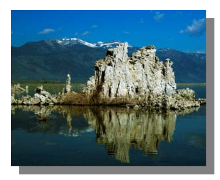
Mono Lake Bessie Reece