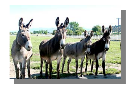
Four Donkeys Gene Lambert

300~ppi~JPEG, no larger than 5"x~5" (will probably be reduced for publication).