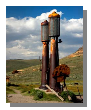
Fill 'er Up Jerry Reece