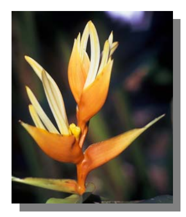
Flame Garden Bird Ralph Solis