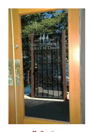
Reflections Lois Behrens