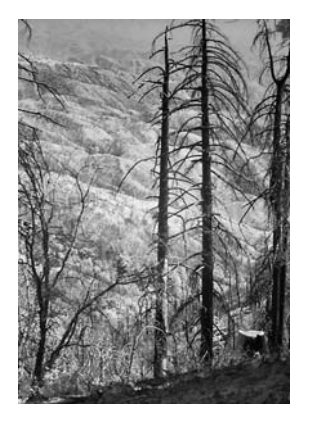
Something Wood Tyler Nordgren