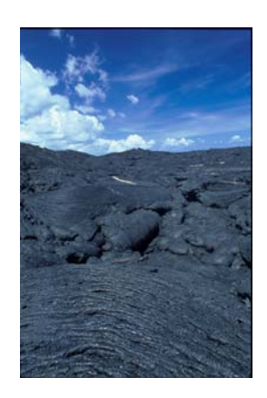
Volcano Lava Ralph Solis