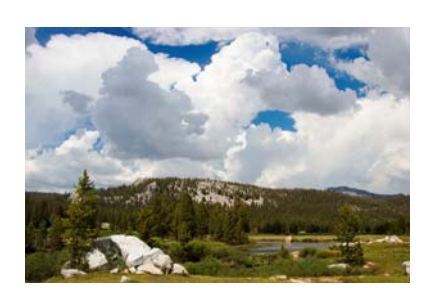
Tuolumne With Clouds Jerry Reece