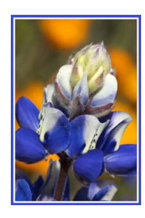
Lupine on Figueroa Mtn. Bessie Reece