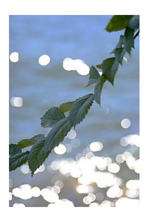
Bling Tyler Nordgren