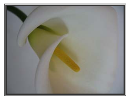
White On White Dorothy Cunningham