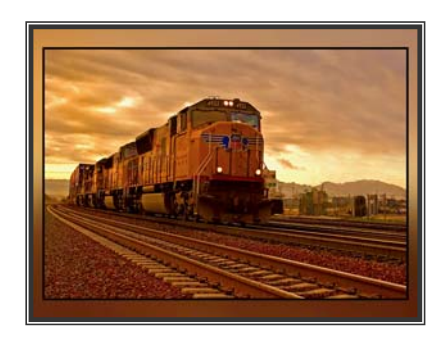
U P Sunrise Jim Smart