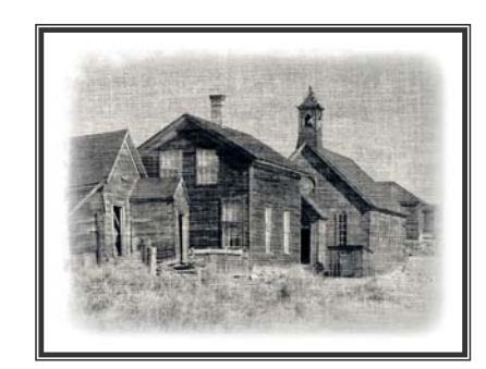
Bodie Gabi Rea