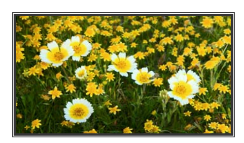
Tidy Tips Phil Burdick