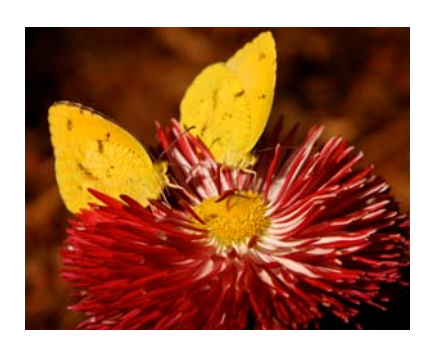
Butterfly Picnic Kish Doyle