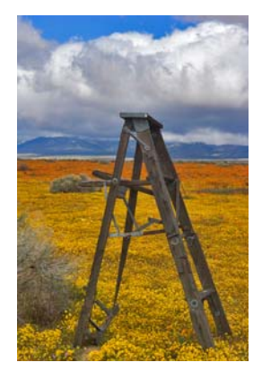
All Done Painting Patrick Flood