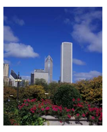
Sunday Chicago Ralph Solis