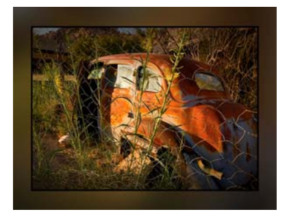
Out To Pasture Jim Smart