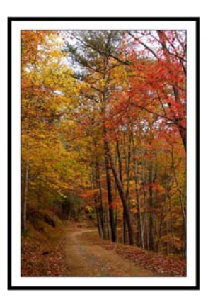
Autumn on Rich Road Jerry Reece