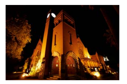
Congregational Church Dan Shorey