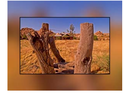
Keyes Ranch Jim Smart