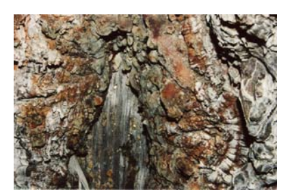
Close-UP Monique Harmon