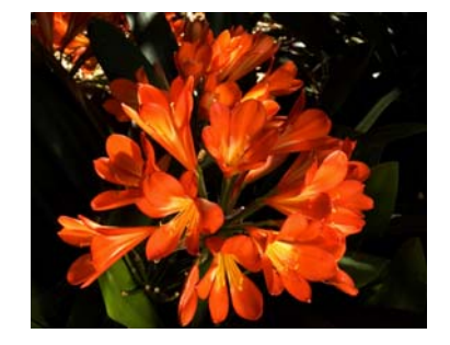
Cliva Bessie Reece