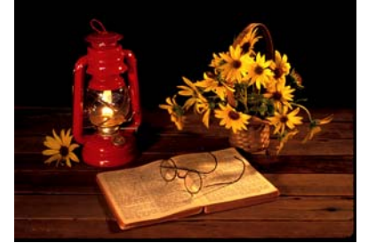
Lantern Light Lois Behrens