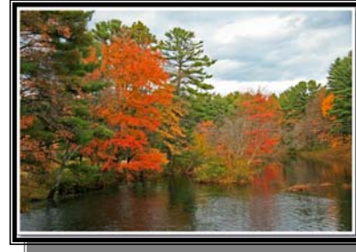
Fall Color 2 Bob Forsythe