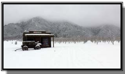
Snowy Apples Ken Wonderly