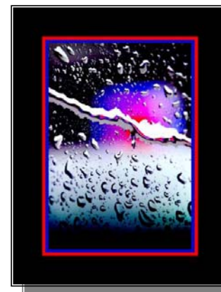
Rainy Day Feeling Dan Griffith