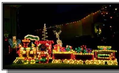
Christmas Train Bessie Reece