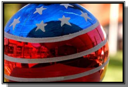
Patriotic Kish Doyle

SHARE YOUR WORK 300 ppi JPEG, no larger than 5"x 5".