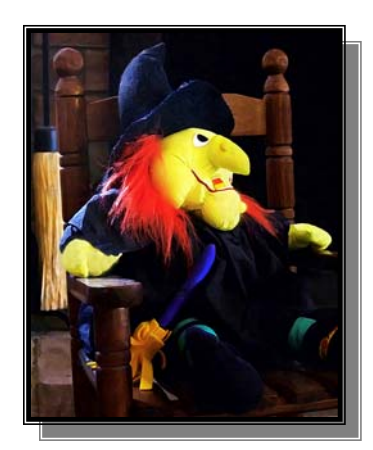
Witchy Woman Wayne Wood