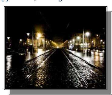
Antwerp By Night