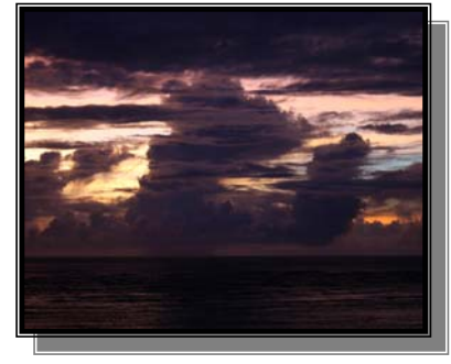
Pacific Storm