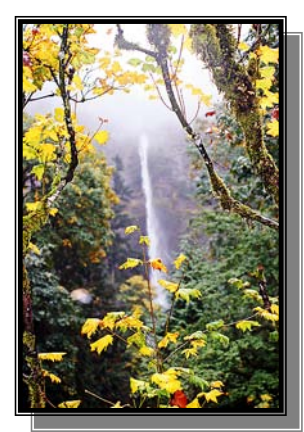
Waterfall