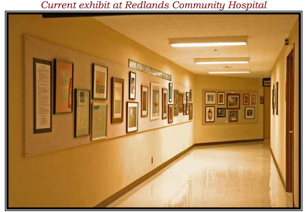
Exhibit Schedule for 2007

The next hanging is TODAY Feb. 1<sup>st</sup> from 3-5 at Redlands City Hall. Hope to see more faces there.