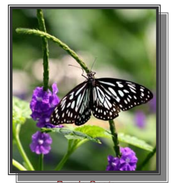
Purple Spots Chris Sveen