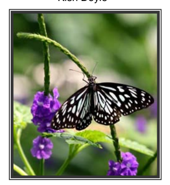
Purple Spots Chris Sveen