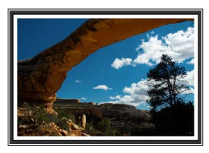
Owochomo Bridge Bessie Reece