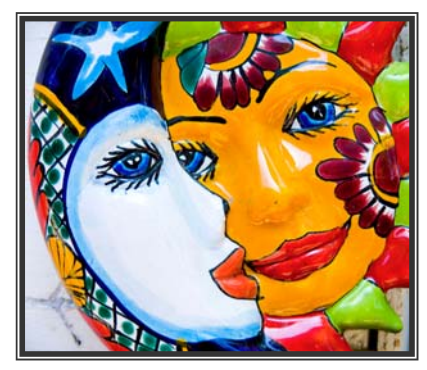
Two Beauties Ken Wonderly