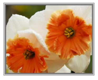
White Orange Daffodil Bessie Reece