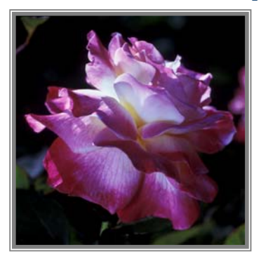
Abracadabra Rose Ralph Solis

Share Your Work: 300 ppi JPEG; no larger than 5" x 5"