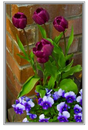
Tulips and Red Brick Patrick Flood