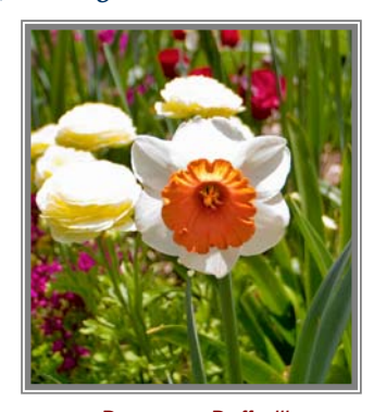
Descanso Daffodil Louis Flood