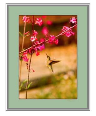
A Quick Bite Jim Smart