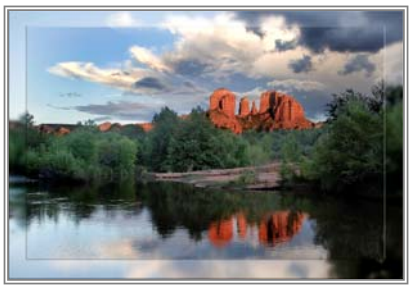
Places – First Place Bruce Bonnett