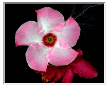
Close-Up – First Place Wayne Wood