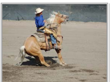
Photojournalism – First Place Char Sveen