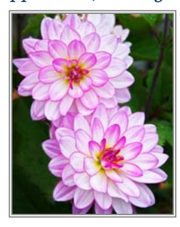
Close-Up – First Place Kathy Posen