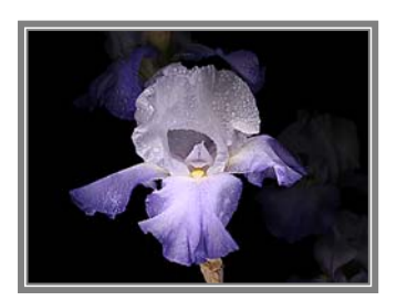
Night Bloom Bruce Bonnett