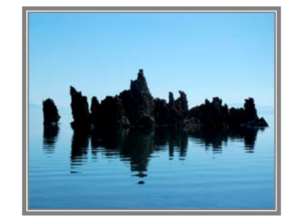
Tufa Silhouette Bessie Reece