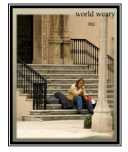
Photojournalism – First Place Shaun Karsemeyer