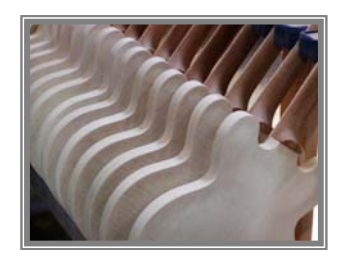
Guitars On Parade Char Sveen