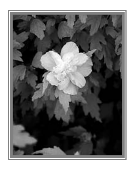
Flowers Tyler Nordgren