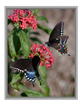
Giant Swallowtails Patrick Flood