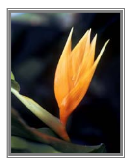
Flaming Brush Ralph Solis