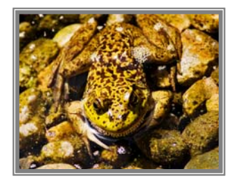
Feeling Froggy Louis Flood

Share Your Work: 300 ppi JPEG; no larger than 5" x 5"