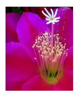
In Cidni's Garden Dan Griffith