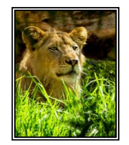
Apprentice Bessie Reece