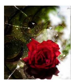
Montage in Red & Green Char Sveen