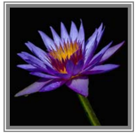
Intermediate Close-Up - First Place Bessie Reece