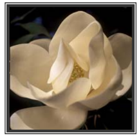
Advanced Close-Up – First Place Ralph Solis