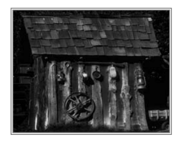
08 Scavenger Hunt Isidro Acevedo