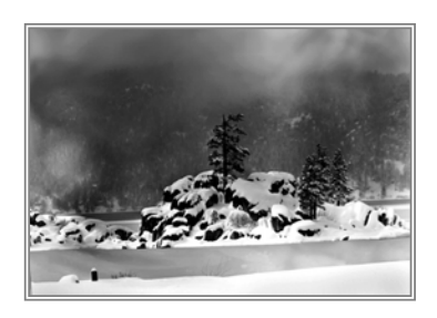
Boulder Bay Dan Griffith