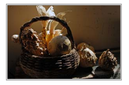
08 Scavenger Hunt Kish Doyle