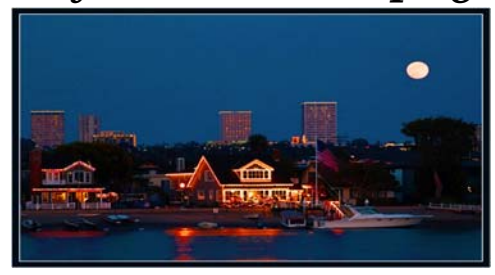
Balboa Isle Bessie Reece