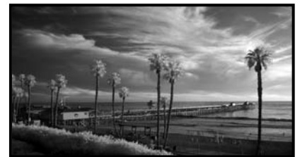
Advanced Places (tie)