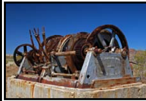
Apprentice Photojournalism Ken Woodford