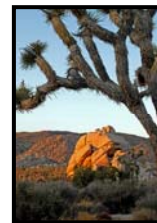
Intermediate 'Scapes (tie) Pat Murphy Joel Block