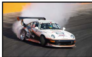
Advanced Photojournalism Allan Alvord