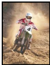
Intermediate Photojournalism Bill Alvord