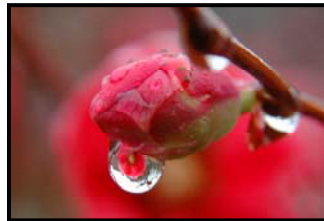
Intermediate Close-Up Ted Norton