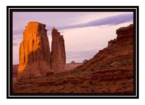
Intermediate 'Scapes Joel Block