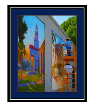
Advanced Photojournalism Judith Sparhawk