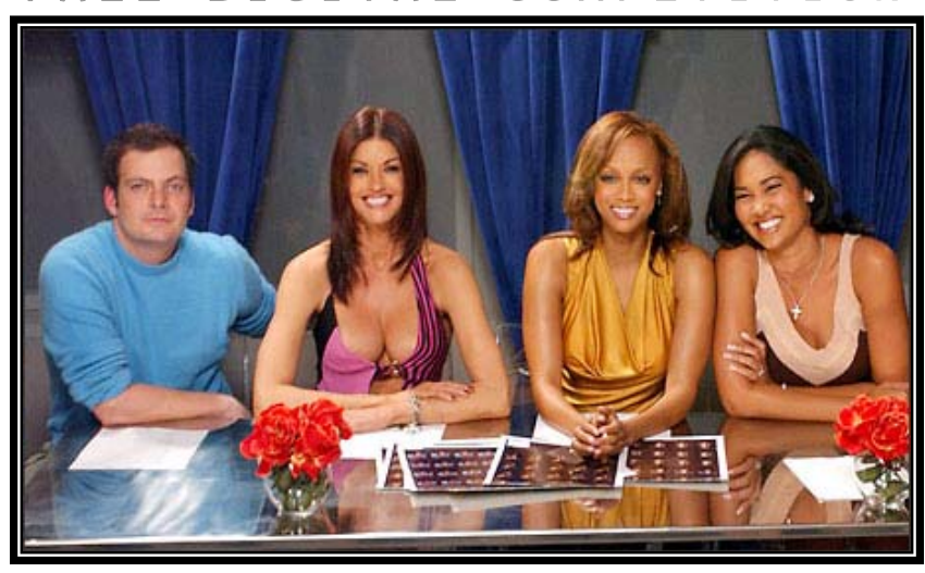
"Don't judge me for being beautiful"

You have from Sept. 7 through Sept. 21 to enter your images.