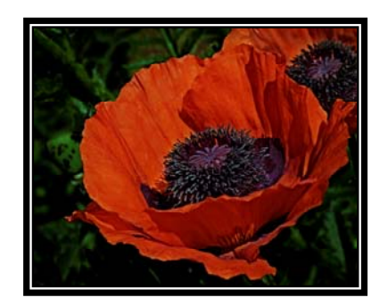
Intermediate Close-Up Bessie Reece