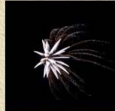
Intermediate Open/Misc - Second Place Russell Trozera