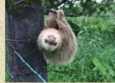
Apprentice Photojournalism - Second Place Ken Fenley