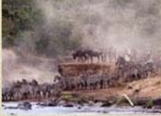
Apprentice Animal - Second Place Penny Schwartz