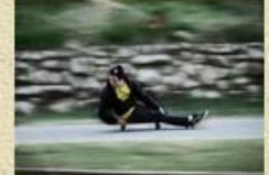
Intermediate People - Second Place Isidro Acevedo