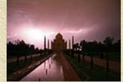
Apprentice Places - Second Place Penny Schwartz