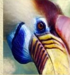
Intermediate Close-Up - Second Place Christine French