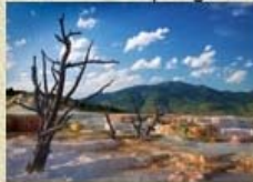
Intermediate Places - Second Place Jerry Reece