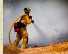
Advanced Photojournalism - Second Place Bruce Bonnett