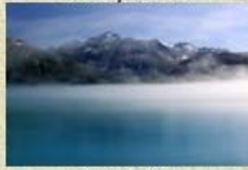
Apprentice Land/Seascape - Second Place Karen Coates