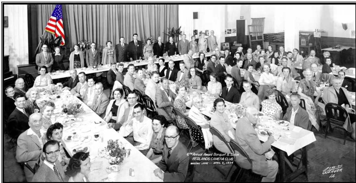
1954 Redlands Camera Club banquet