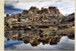
Intermediate Land/Seascape - Second Place Rich Asman