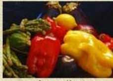
Apprentice Close-Up - Second Place Darlene Lindsey