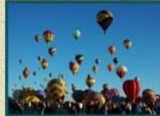
Intermediate Open/Misc - Second Place Dick Molony