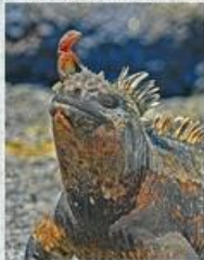
Advanced Close-Up - First Place Les Coombes