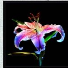
Intermediate Close-Up - First Place Rich Asman