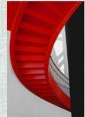
Advanced Open/Misc - First Place Judith Sparhawk