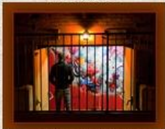
Intermediate Photojournalism - First Place Larry Huddleston