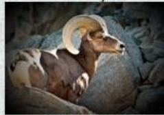
Intermediate Animal - First Place Pat Murphy