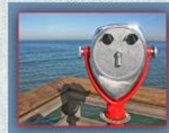
Intermediate Land/Seascape - First Place Larry Huddleston