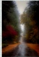
Apprentice Land/Seascape - First Place Debra Dorothy