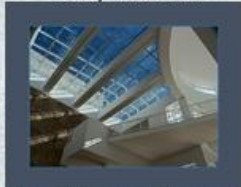
Intermediate Places - First Place Robert Upton