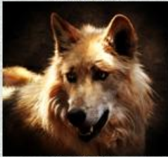
Apprentice Animal - First Place Debra Dorothy