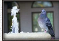
Apprentice Photojournalism - Second Place Billie Leckey