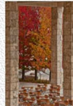
Advanced Places - Second Place Sandy Woodcock