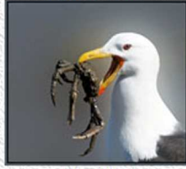
Apprentice Animal - Second Place Bitsy Berner