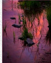
Advanced Land/Seascape - Second Place Bruce Bonnett