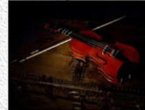
Intermediate Open/Misc - Second Place Debra S Dorothy