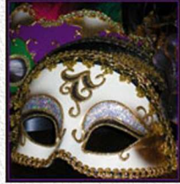
Apprentice Close-Up - Second Place Beverly Brett