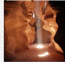
Intermediate Land/Seascape - Second Place Russell Trozera