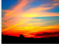
Apprentice Land/Seascape - Second Place Zara Brett