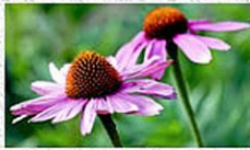
Intermediate Close-Up - Third Place Arun Sivanandam