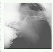
Apprentice Open/Misc - Third Place Zara Brett