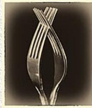
Intermediate Open/Misc - Third Place Rich Asman