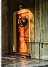
Intermediate Places - Third Place Debra S Dorothy