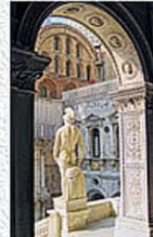
Advanced Places - Third Place Les Coombes