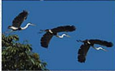
Intermediate Animal - Third Place Lyle Hammond