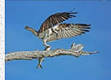
Advanced Animal - Third Place Les Coombes