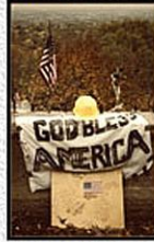
Apprentice Photojournalism - Third Place Beverly Brett