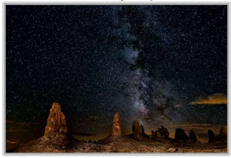
Nightscape Trona Pinnacles by Bessie Reece Congratulations, Bessie. Well done!