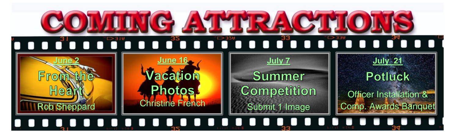
Click HERE for 2014 Calendar of coming events (linked to RCC.com website)

But here's the danger; after becoming comfortable spending those 15 seconds, you're gonna want to explore Elements to see what more you can do!