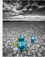
Got Water Intermediate - Photojournalism First Place Dave Ficke