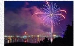
Rockets Red Glare Advanced - Photojournalism First Place Kish Doyle