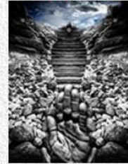
Stairway Intermediate - Places First Place Robert Minter