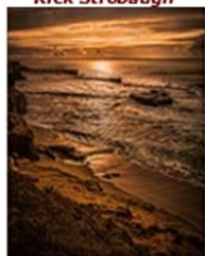
Sunset On The Beach Advanced - Places Second Place Rick Strobaugh