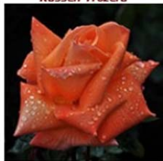
Orange Dew Drops Intermediate - Close-Up Second Place Russell Trozera