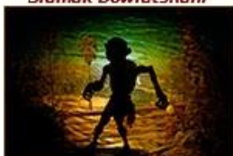
The City Controller Advanced - Close-Up Third Place Siamak Dowlatshahi