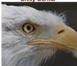
Eagle Eye Intermediate - Animal Third Place Bitsy Bernor