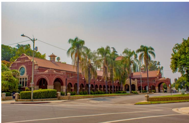
A.K. Smiley Public Library