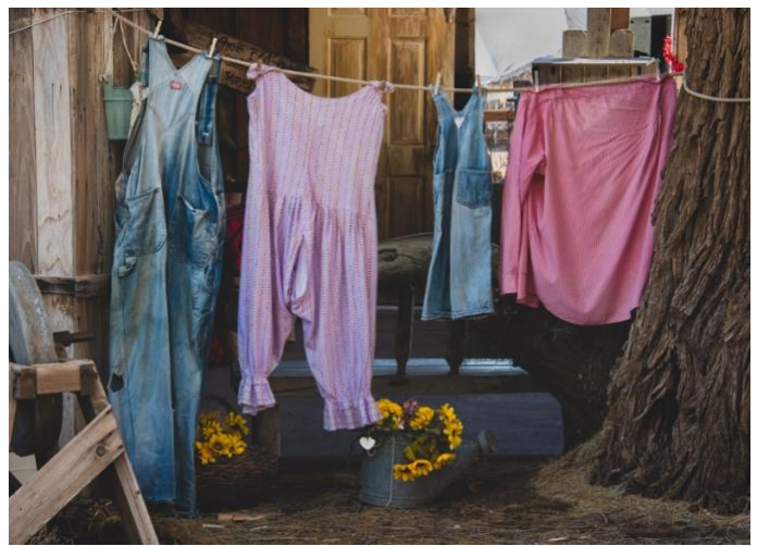
By Tracy Reyes