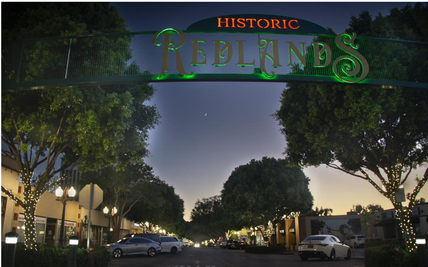
Redlands at Night by Donald Purdey